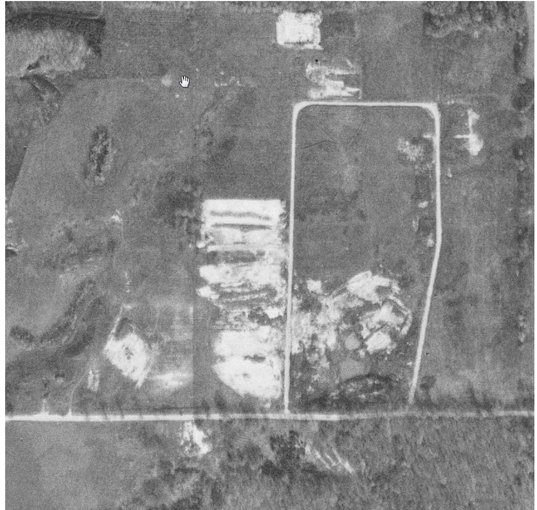
House Street Disposal Facility 11-1965 USGS aerial photograph