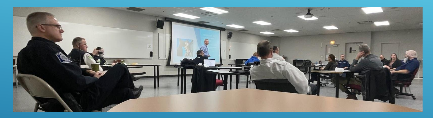
Table Top: Roskam Baking Company (March 23, 2022)